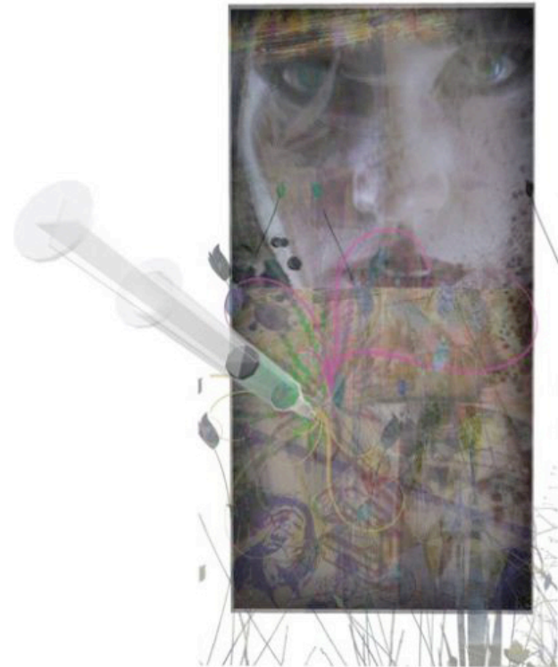
"Requiem 2", By Feathers Boa