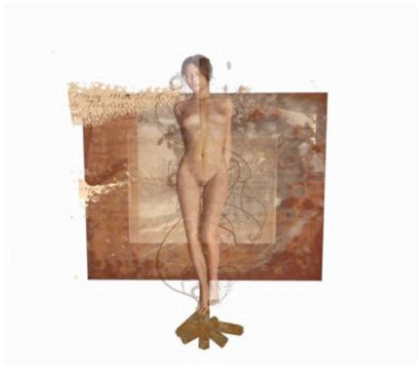
"Witch Hunt 1", By Feathers Boa

some pieces that will never be shown again because the pieces were "hated" or disturbed people. When I was shown these controversial pieces I was astonished to see that these were in fact great art works when viewed with an open mind.