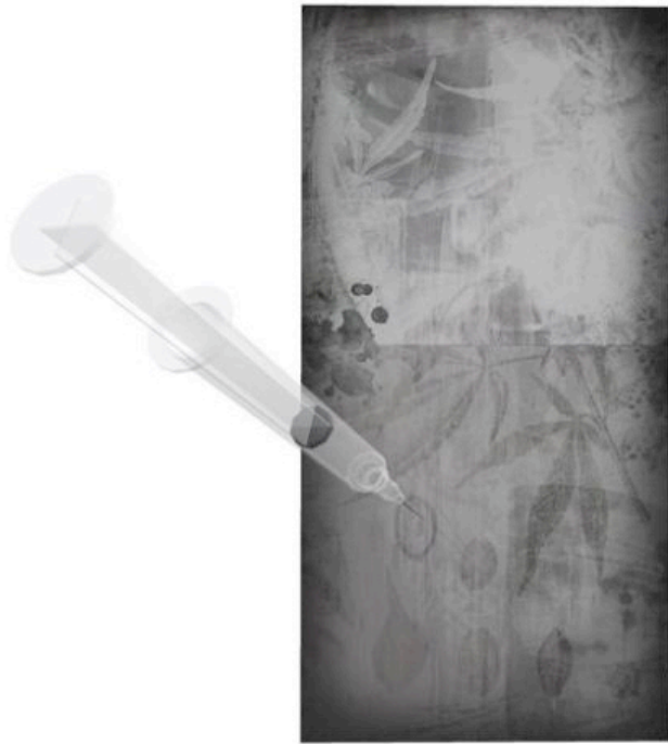
"Requiem 1", By Feathers Boa